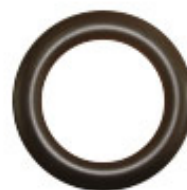
Matte Black EY40IZ/MB