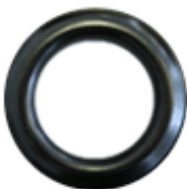
Black Copper EY40BC