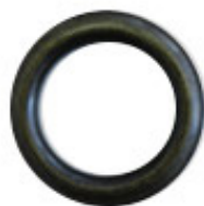
Gun Metal EY40GM