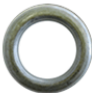
Antique Silver EY40AS