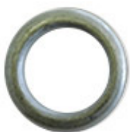
Silver Milk EY40SM