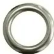
Stainless Steel EY40SS

Custom colours are available on request. Please note that minimum order quantities will apply.