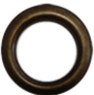
Antique Copper EY40AC