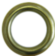
Copper Brass EY40CB