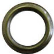
Antique Brass EY40AB