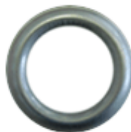
Satin Nickel EY40SN